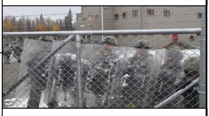
Able Company Paratroopers responding to a civil disturbance