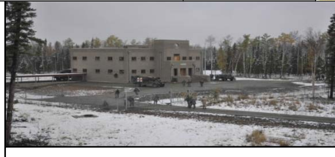
Able Company Paratroopers securing the U.S. Embassy

CDR Notes: The TLP process was well received by the Company. The majority of the company individuals understood their task and purpose and were able to rehearse the different tasks prior to mission. During the exercise, PLs exercised great skill in their force protection posture upon arrival and the continual reassessment of their posture. This allowed the AMCIT evacuation to run smoothly with the Ambassador and the DOS PAX very appreciative of the support from the Company. PLTs also practiced crowd control as well as MEDEVAC